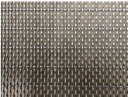
Single Wire Slot

Please consult with the sales team for further information.